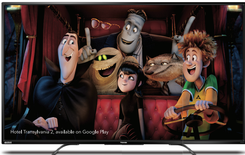
Liquid Crystal Display with Direct LED Backlight.